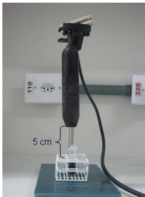
Figure 1. Position of the pen for irradiation of blood.

The experimental procedures were conducted in accordance with ethical committee for the care and use of animals of Instituto de Biologia Roberto Alcântara Gomes da Universidade do Estado do Rio de Janeiro (UERJ), number protocol CEA/134/2006.